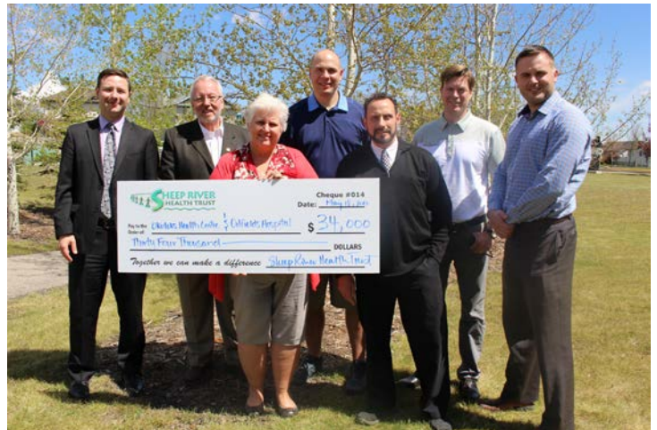
2017 Cheque Presentation -Okotoks Health & Wellness Centre Urgent Care Renovation